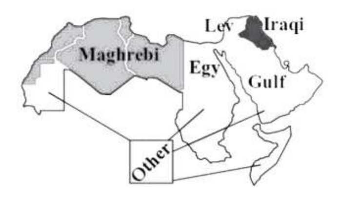
Figure 2. Major Dialects in the Arab World [<sup>1</sup>]