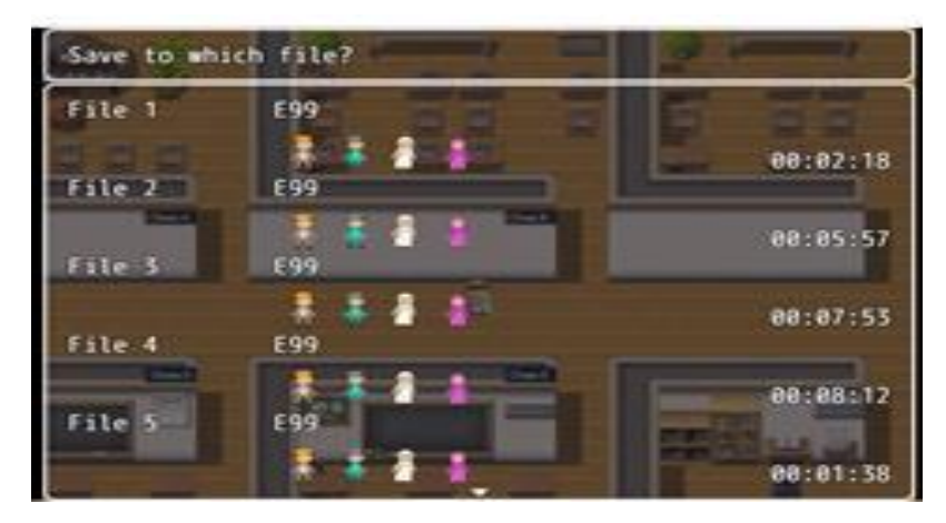
Figure 7. Database Menu