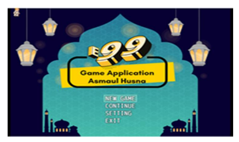
Figure 1. Main Menu