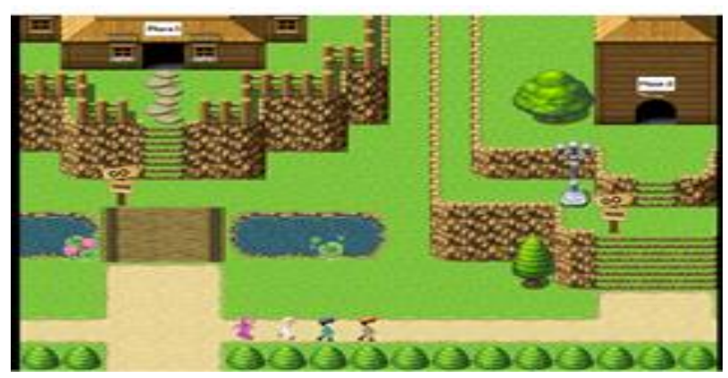
Figure 8. Example Map