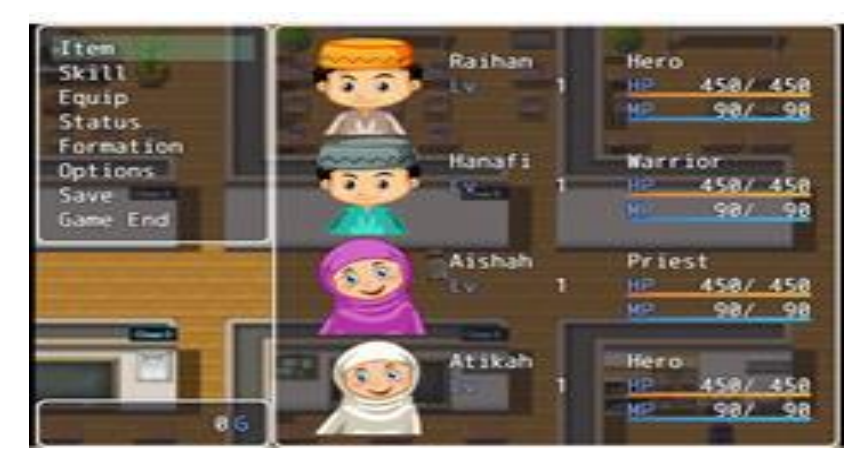
Figure 6. Pause Menu