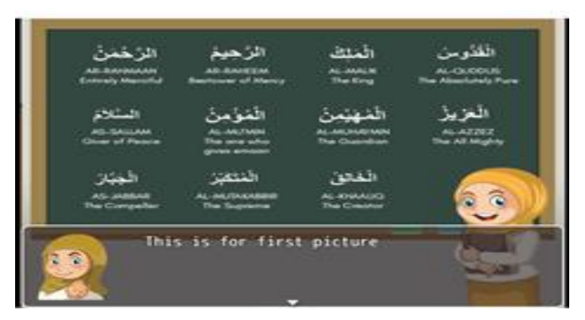
Figure 4. Study in Class