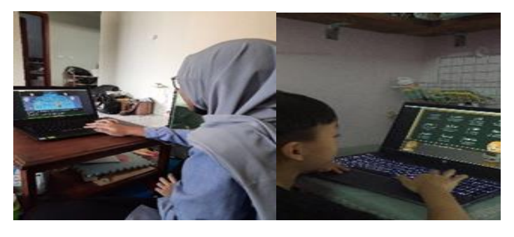
Figure 11. Usability Testing from Respondent

The samples of the study were involved 20 respondents aged 7 - 14 years old.