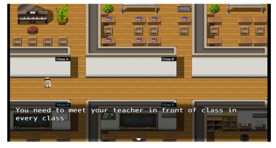
Figure 3. Map of School