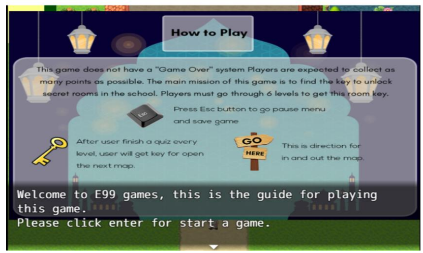
Figure 2. How to Play