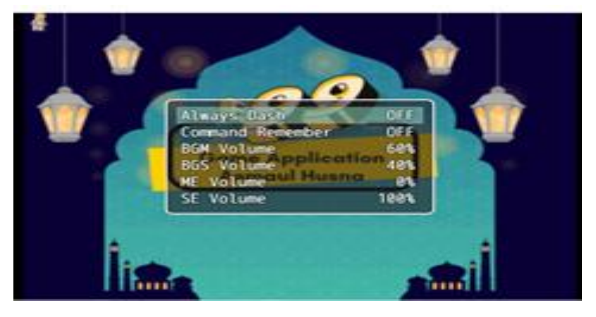
Figure 9. Setting Menu