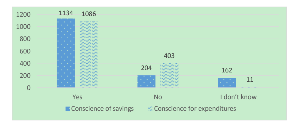
Figure 3. Perception towards conscience of savings and expenditures

Based on survey, the people perception towards family savings have changed. The majority of the in interviewers have increased their savings during this last year. On the other hand the expenditures towards food have been lightly increased, whereas as the respondents have answered, they have decreased the expenditures on the luxury goods.