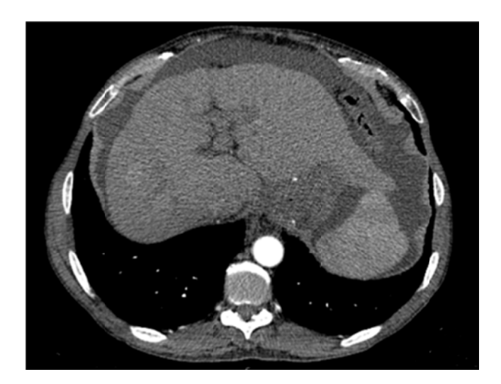
Figure 4. Abdominal tomography showing the 2.3 cm hypervascular solitary lesion in segment VII/VIII, compatible with HCC.

A 63-year-old male patient with established cirrhosis due to hereditary hemochromatosis, complicated with portal hypertension (esophageal varices with previous hypertensive bleeding episodes, pancytopenia due to hypersplenism and refractory moderate ascites), presented in April 2014 with a hepatic nodular lesion in his biannual ultrasound HCC screening. His past medical history was remarkable for partial gastrectomy in 2007 due to early gastric cancer without evidence of recurrence and type 2 diabetes mellitus. He suffers also from porphyria cutanea tarda secondary to is primary iron-overload syndrome.