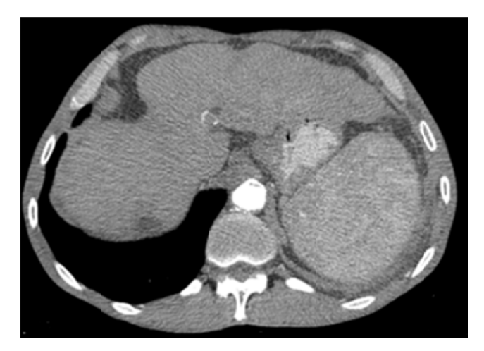
Figure 3. Tomography imaging 1 month after radiofrequency ablation, showing no evidence of tumor

According to the clinical practice guidelines for HCC, he was a candidate for curative treatment. Due to his associated medical condition – chronic lung disease, he was not suitable for surgical approaches and he was subjected to radiofrequency ablation in January 2012, with no evidence of tumor in the first follow-up tomography (1 month after) (see Figure 3) and preserved liver function.