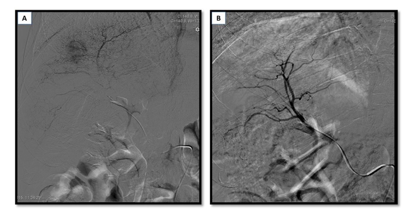
Figure 5. Transarterial chemoembolization of the nodule. A. Pre-procedure imaging. B. Immediate post-procedure imaging showing completely destruction of tumor blood supply