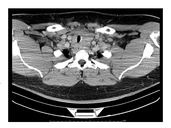
Figure 1. Post-surgical CT image, showing enlargement of the left lobe of the thyroid, a mediastinal mass measuring 5.5 cm surrounding the trachea, and multiple supraclavicular lymphadenopathies.

A 38-year-old male patient had a past medical history of obesity and sleep apnoea syndrome. Notable aspects of his family history were a mother diagnosed with colon cancer, one paternal uncle diagnosed with stomach cancer and another paternal uncle diagnosed with cancer of the pancreas.