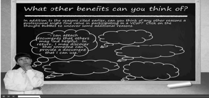
watch a video about the benefits of VCoP