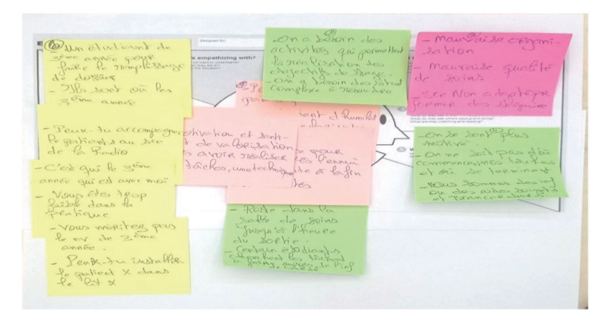
Figure 3. The empathy card used for the immersion process