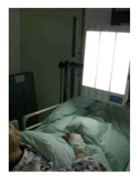
Figure 2. Bringt light treatment for patients