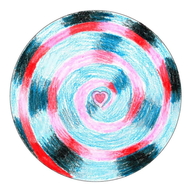
Figure 10. Coping