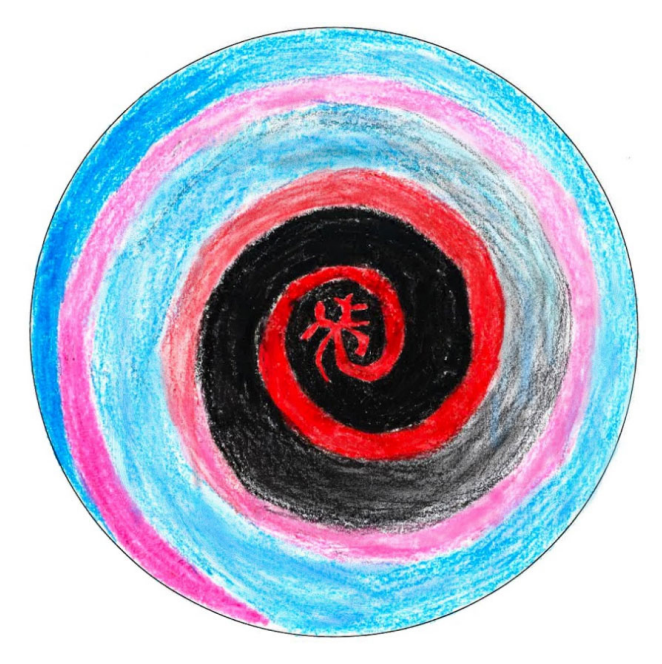
Figure 9. A golf-ball sized lump