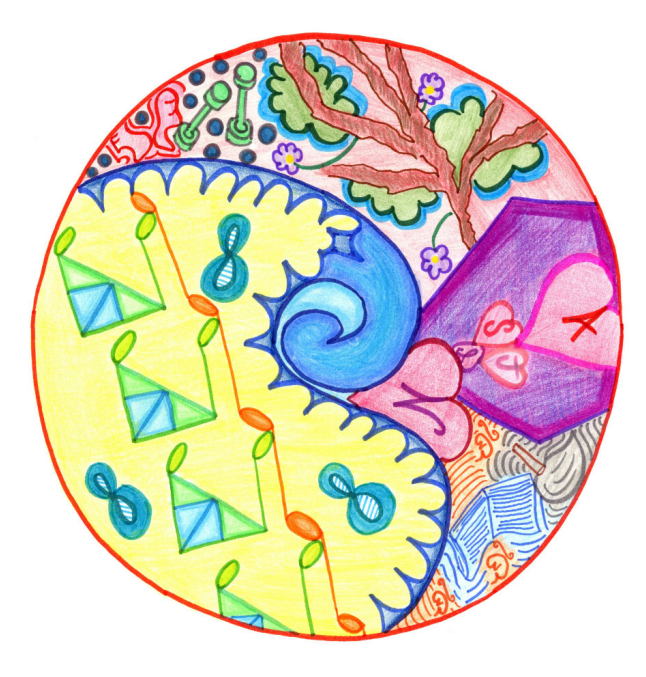
Figure 6. Support systems

desire for a visit to my hometown and my family so that my ongoing loneliness can be relieved. However, since travelling is not feasible during the school year, such desire becomes a constant stress that greatly affects my life. As illustrated in my mandala, even though my living environment is bright and vibrant like the red color in the background, everything in front of me appears to be coated with a sorrowful dark grey color."