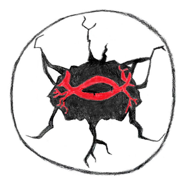
Figure 3. A breakdown

represent my experience of a 'breakdown'. Similar to cracking pavement, my internal integrity was no longer whole as I was experiencing exceptional disruption of my physical, emotional, and psychological well-being. The black color utilized in the cracks represents the lonely isolation I experienced during my time of stress. The experience of isolation did not occur due to the lack of human interaction, rather, isolation manifested because I experienced my stress in complete silence without recognition from others. The red, gorging blood vessels in my mandala adds a humanistic aspect to my experience of stress as I, a human being with emotions and sensations, endured the suffering; this also symbolically represents the activation of the sympathetic nervous system that occurs with stress. The black cracks in conjunction with the red blood vessels depicted my experience as my stress began to break my body down in remote isolation."