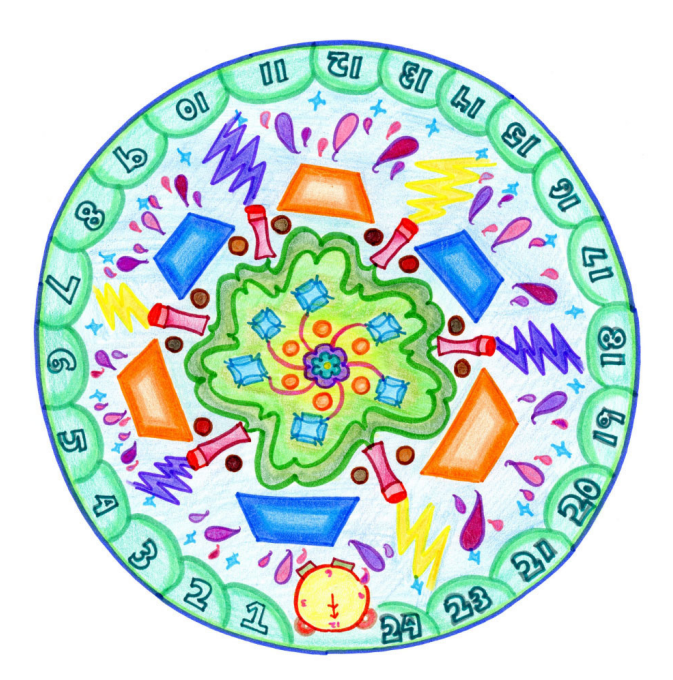
Figure 5. A driving force

and its symbolism of water to be calming. The other side of my mandala is covered with colorful musical notes because I often turn on music to cope, which uplifts my confidence and puts me in a cheerful mood. The five hearts represent each of my family members with whom I possess a close relationship. The lighter colors represent my younger family members because they remind me of my childhood and allow me to relive those memories. The larger and darker hearts represent my parents who guide me using their extensive personal experiences. The top corner of my mandala includes symbols that represent the value that I have for my culture and spirituality. I believe in God and praying helps me to cope because it brings peace to my mind and acts as a stress reliever. The bottom of my mandala encompasses nature and gym equipment/attire because working out, playing sports, and taking walks allow me to physically and mentally relax. As represented in my mandala, I use a positive approach to cope with stress and I have several internal and external support systems."