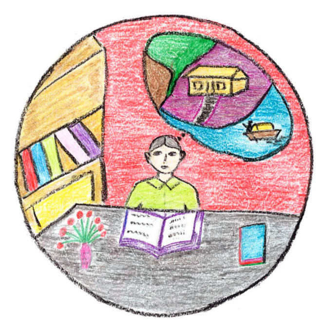
Figure 7. Isolation

swirl, while my mental state is represented by the blue and black swirl. To illustrate the beginning of my narrative, the outside of my mandala is pink and blue to demonstrate my positive perception and my peaceful mindset, respectively. My experience of stress began when I discovered a golf-ball sized lump on my neck and was presented with the possibility of cancer. The dyad of my perception of reality and mental state was negatively impacted as the stress accumulated, and is depicted as the pink and blue swirls become red and black, respectively. The boldness of the red shows how my positive perception became grim and alarming with concerns for my health. The dark blue and black demonstrate that my peaceful mental state was eclipsed by feelings of loneliness, uncertainty, and despair. At the core of my mandala, the dark red sprawls outwards into the black to depict how my negative perception of the stressful event overwhelmed and diminished my mental state."