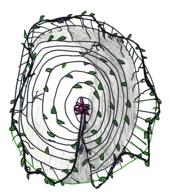
Figure 1. The breaking point