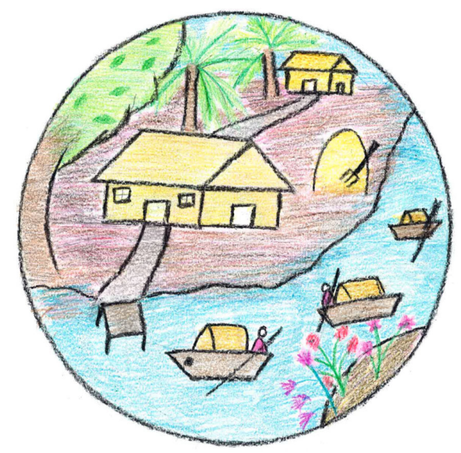
Figure 8. Travelling home

respectively. As my medical ordeal resolved with no lifelimiting illness, the mandala swirls into a bright core with a pink heart to demonstrate the positivity and importance of social support in my experience of coping."