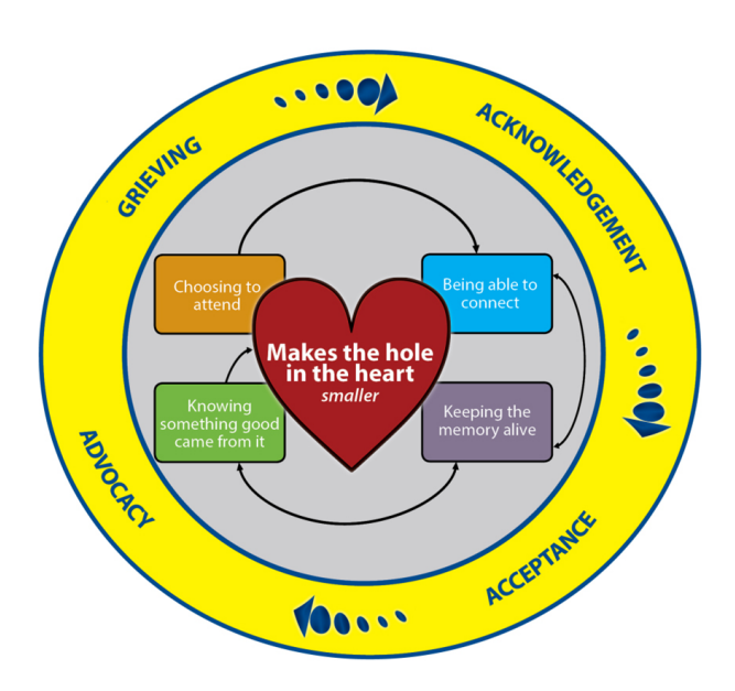
Figure 2. Illustrates the emerging theory "Makes the hole in the heart smaller" transcendence into the community

Our staff feel empowered to tell families about our annual ceremony to celebrate the gift their family member gave so another can live. The families can now share their experience with others and through their grieving and acceptance of support, families become advocates of memorial ceremonies and organ donation. Thus, metaphorically making the hole in the heart smaller, as well as reducing the gap between available organs and those in need through organ donation efforts and awareness. With the permanent fixture of the Tree of Life Memorial in a public area, it is a constant reminder of the gift of life that so many have given within our community. The healing that occurs transcends from an individual level to a community of awareness and promotion of organ donation (see Figure 2).