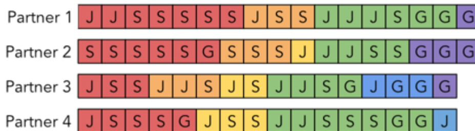
Figure 1. Disciplinary profile of the September-December (Fall) 2020 of ICON semester showing the distribution of junior (J, inner ring) and senior undergraduate (S, middle ring) students and graduate students (G, outer ring) from different discipline areas across the university, within the course and within each Community Partner project group