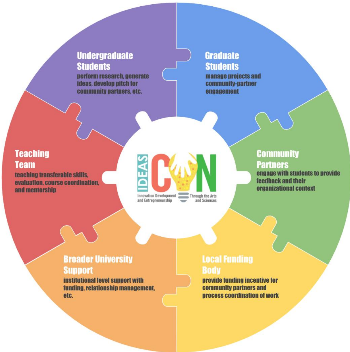
Figure 2. The roles of each of the participants and stakeholders within the ICON course structure