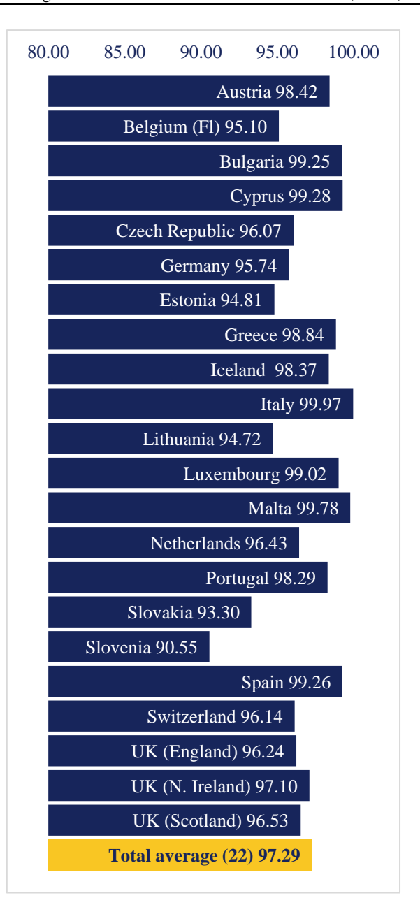
Figure 2. Age sample enrolment rate in inclusive education for 9-year-olds, based on the enrolled school population of 9-year-olds (%)