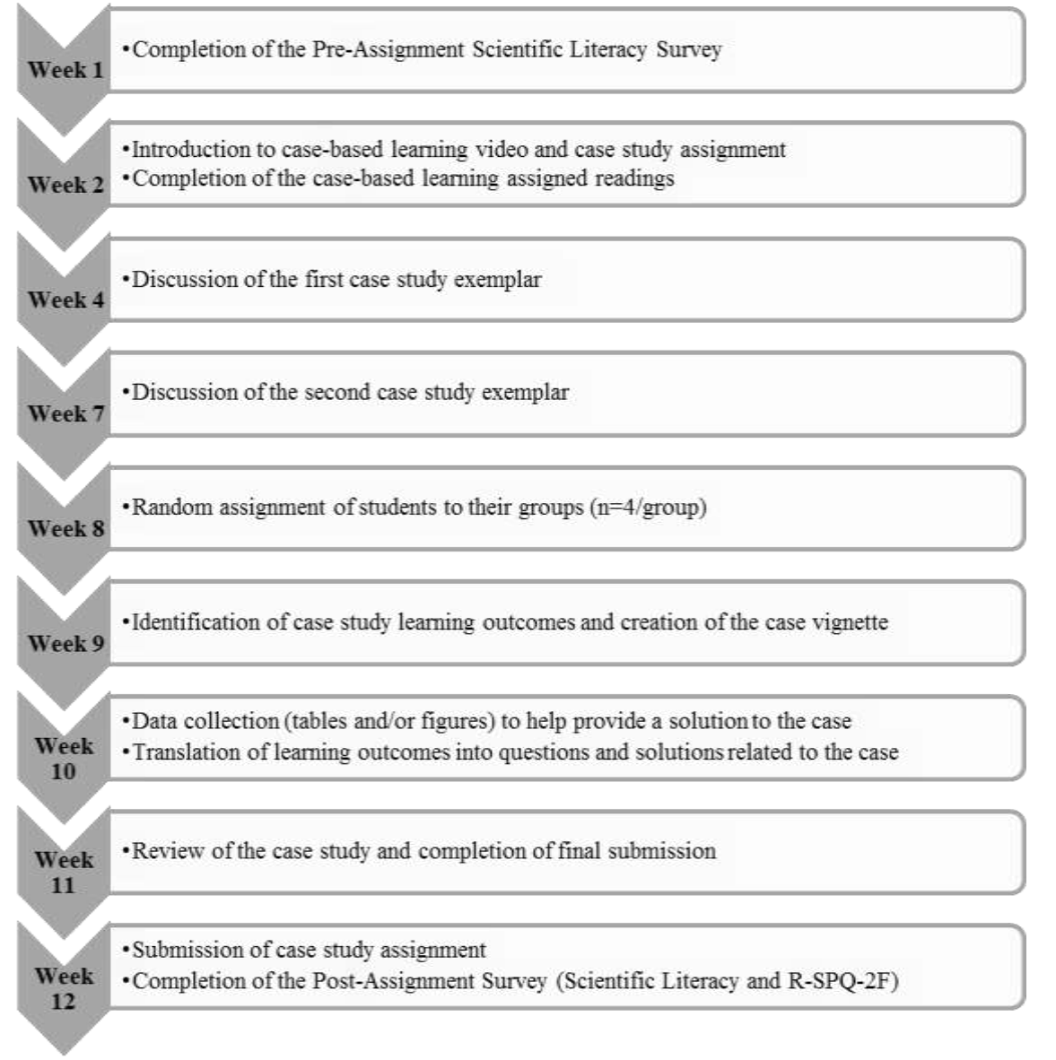
Figure 2. Outline of the scaffolded case study assignment activities throughout the 12 week semester.

week 10, students were instructed to work collaboratively to identify and collect data in the form of tables and/or figures that will help provide a solution to their novel case. Additionally, students worked to translate the learning outcomes from week nine in to specific questions and solutions that relate to the case. In week 11, students were instructed to review and edit their case study and to prepare a final draft according to the formatting specifications outlined in week two when the requirements of the assignment were provided to students. In week 12, students submitted their final case study group assignment for grading by the teaching assistant. Additionally, in week 12, students were invited (by email) to complete the post-assignment survey that consisted of two parts i) the SL questions (identical to the pre-assignment survey completed in week one of the semester) and ii) the Revised Student Process Questionnaire with Two Factors (R-SPQ-2F) (Biggs et al., 2001).