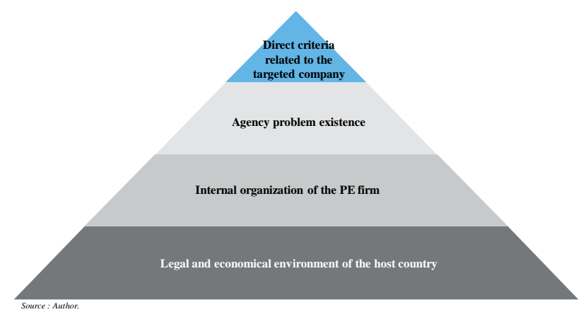
Figure 1. Pyramid of PE firms rational investment incentives

As presented above, PE firms put into the heart value creation as a major consideration in the selection process, that lead the way to the right targeted company. To sum up, we propose the following pyramid that emphasis, the four layers of rational motivations that could explain the selection process.