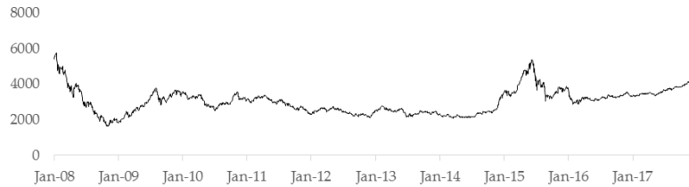
Figure 1. CSI 300 Index

The Ljung-Box Q test is a frequent test in the context of volatility clustering analysis with several articles such as (Stoffer 1992) using it.