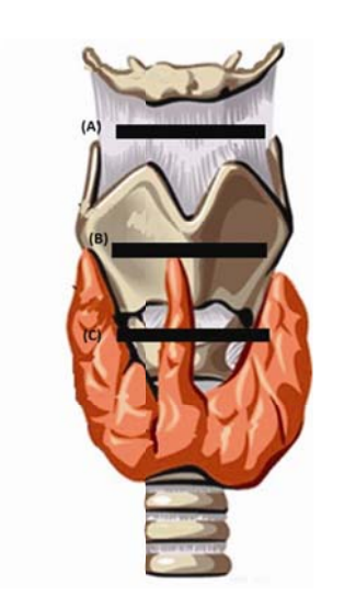
Figure 1. The 3 points to place the transducer of ultrasonography to observe the vocal fold

The 3 points to place the transducer of ultrasonography to observe the vocal fold. The transducer was placed transversely over three points: A) thyrohyoid membrane; B) thyroid notch; and C) cricothyroid membrane. The black bars indicate the location of the transducer.