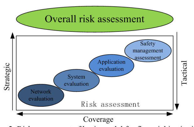
Figure 2. Risk assessment of basic model for financial institutions

1) Comply with the internal and external situation of financial institutions (see Figure 2). Financial institutions credit risk management work, in order to financial institutions internal planning and external market conditions for the fundamental, in particular, the competition between financial institutions to rationalize, in accordance with the financial institutions of the "profit" and "risk return" as the guide. And it is a combination of the new Basel agreement internal credit risk scale standards, in order to build a credit risk assessment model, it is able to adapt to the internal planning and external competition of financial institutions. Financial institutions in the construction of credit risk assessment model is not just to assess the credit risks of financial institutions a business. Instead, it is based in domestic and international financial markets, considering financial institutions internal business in financial market positioning, in order to make the risk assessment results fit the internal and external environment of financial institutions.