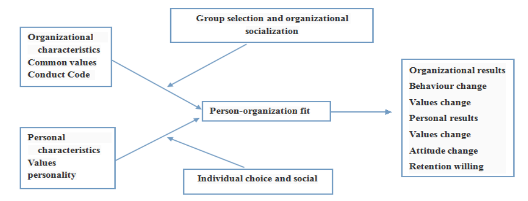
Figure 1. Chatman person-organization fit model

Person-organization fit recruitment model, referring to the cooperation between the individual and the organization. But the meaning of individuals and organizations are extremely complex in the study. Chatman think that it should be understood based on the interactive point of view. His organizational model shown in Figure 1, he thinks the organizations attract employees with similar characteristics, and select them into the organization. With the passage of time, the staff who characteristics conflict with organization can leave the organization, so the homogeneity of organization gradually increase, heterogeneity gradually decrease. This model indicates that the results of Person-organization fit can improve the organizational behavior, norms and values and personal values, attitudes. However, more and more researchers pay attention to the point of view in compatibility between individuals and organizations.