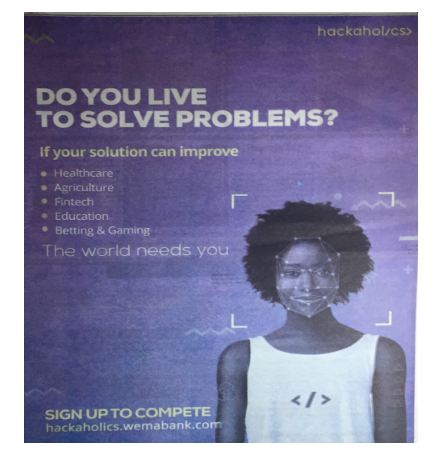
image of the webbed-face lady and the purple colour are highly significant as they celebrate women's multifaceted and multi-tasking qualities in positively impacting society in various fields of endeavour.