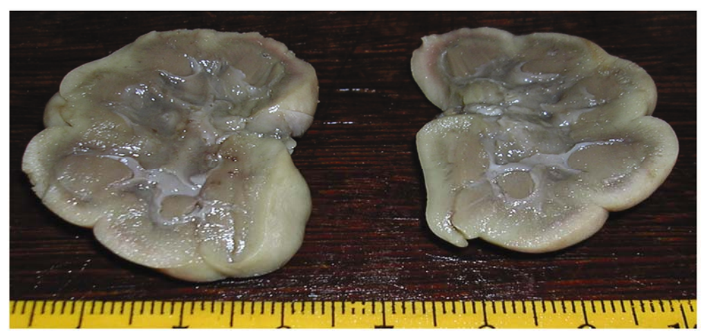
Figure 1. Section of the right kidney without any remarkable finding