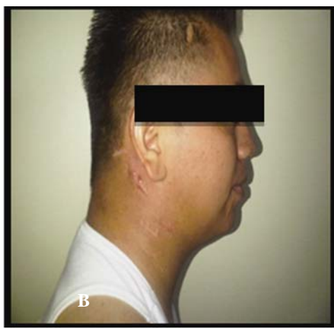
Figure 6. Patient after completing the treatment for zygomycosis in April 2013

Zygomycosis has been a recognized entity for many years, affecting more commonly the immunocompromised patients. However, there should be a high clinical suspicion to establish its diagnosis, especially in atypical immunocompetent patients.