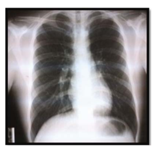
Figure 3. Chest X-ray

Per records, three previous biopsies had been performed showing Langhans multinucleated giant cells with areas of necrosis and acid-fast (AFB) negative, without evidence of fungi. Two biopsies of the mass at our institution showed similar findings. Consistent with the finding in biopsies and the previously unremarkable workup, the differential diagnosis included granulomatous pathologies, lymphoproliferative diseases, and other neoplastic pathologies. Despite the prevalence of tuberculosis (TB), AFB was negative in all samples. Additionally the patient reported having completed anti-tuberculosis therapy. Despite eosinophilia, a common finding in Hodgkins disease, biopsy of the mass and bone marrow did not show malignancy. Therefore, with eosinophilia and granulomatous reaction on biopsy, we started empirical antifungal treatment with itraconazole. The patient remained in stable condition until December 2012 when he began to experience difficulty opening his mouth. Stridor was observed during the exam and, for this reason, a steroid treatment was started improving his symptoms.