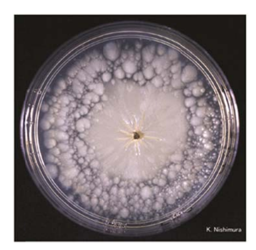
Figure 5. B. ranarum colony illustration

Humans have an effective and rapid response to zygomycetes. Therefore, deficiency of phagocytic cells is one of the main risk factors; either deficit in number (neutropenia) or decline in function (steroid use and ketoacidosis). Thus, zygomycotic infections are characteristic of immunosuppressed patients [6]. This particular factor could not be demonstrated in our patient. In immunocompetent patients, zygomycoses produce a pattern of predominantly skin and subcutaneous tissue infections. The dependence of the primary infection site on the immunocompetence of the host is illustrated in a review of 929 cases by Roden et al. [12]. Treatment can be both surgical and antifungal therapy. Amphotericin B, with a very low MIC, is the most potent antifungal available [6] but is largely ineffective in the most advanced cases [13]. Other antifungals can be used for treating B. ranarum. In few studies, potassium iodide was used as the first alternative [4, 14], placing co-trimoxazole, miconazole, ketoconazole and itraconazole as a secondary treatment [5, 15, 16]. Voriconazole by contrast has a very high MIC and is clinically ineffective in invasive zygomycoses [3]. Our patient showed a poor response to