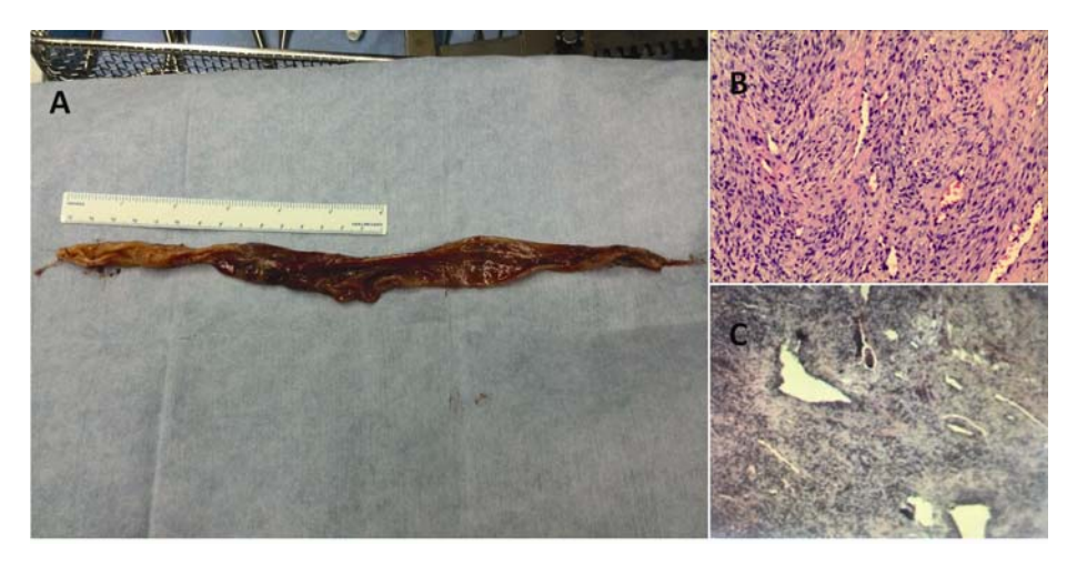
Figure 2. Pathological examination. A: giant tumor mass (29 cm in length, 1.0 cm~2.8 cm in diameter); B: hematoxylin-eosin staining; C: immunohistochemical staining