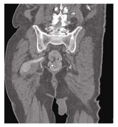
Figure 1. CT of PSA demonstrating thrombosed sac with pseudoaneurysm

He lived at home with his wife who was his main carer and he required significant help with his activities of daily living. He was an ex-smoker and did not drink alcohol. There was no significant family history. Routine tests demonstrated a microcytic anaemia, with a haemoglobin of 51g/dl which likely contributed to his fall. A compturisted tomography (CT) scan of the brain excluded a stroke and oesophago-gastroduodenoscopy to look for a gastrointestinal source of bleeding demonstrated a gastric polyp only; this was excised. CT abdomen/pelvis showed diverticular disease and demonstrated a right PSA with a 6.2 cm pseudoaneurysm. This was confirmed on CT angiography of the abdomen and lower limb (see Figure 1, 2 and 3). The PSA was continuous with the popliteal artery in the leg, and the superficial femoral artery was of small calibre and did not extend past the mid-thigh. A diverticular bleed was deemed to be the cause of his anaemia and the finding of the 6.2 cm sciatic artery aneurysm was considered to be incidental. He was transfused with 4 units of blood and his haemoglobin remained stable during his inpatient stay.