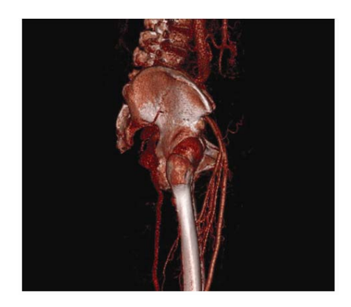
Figure 3. CT Reconstruction of PSA (lateral view)