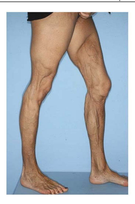
Figure 3. Diffuse and symmetric lipoatrophy from the root of thighs to the ankles of lower limbs