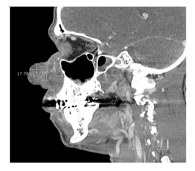
Figure 2. Lateral CT scan of face shows a multi-loculated, poorly defined fluid collection is present with a well-defined peripheral enhancing wall suggesting phlegmon versus early developing abscess involving the right nose, measuring approximately 1.7 cm \times 1.5 cm \times 1.1 cm.

the right lateral nostril with serosanguinous drainage present. The patient also had bilateral infra-orbital edema. Anterior cervical lymphadenopathy was present.