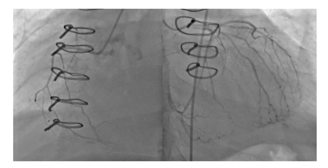
Figure 2. Coronary angiography revealed no obstructive coronary disease

The etiology of his acute decompensation was unclear, however consideration was given to autonomic dysfunction secondary to GBS, acute cellular rejection, and acute myocardial infarction secondary to serum hyperviscosity related to the IVIg infusion. Two days following intubation, empiric treatment of rejection was initiated with pulse dose steroids as no endomyocardial biopsy could safely be obtained at the time. The next day, plasmapheresis was started for further treatment of GBS. Following the second session of plasmapheresis, his mental status, hemodynamics, and end organ function began improving. The patient started producing