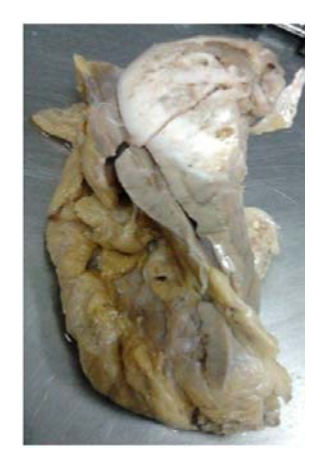
Figure 2. Gross picture of renal carcinoid. The mass was a well-circumscribed; light brown; soft to firm mass. The cut surface is cystic.

The post operative course was smooth. On retrospective evaluation, the patient didn't show any symptoms of carcinoid syndrome such as facial hot flushes and diarrhea. Postoperative colonoscopy and upper gastrointestinal endoscopy revealed no abnormality pertaining to gastrointestinal source of the tumor. No tumor recurrence was detected on close CT follows up.