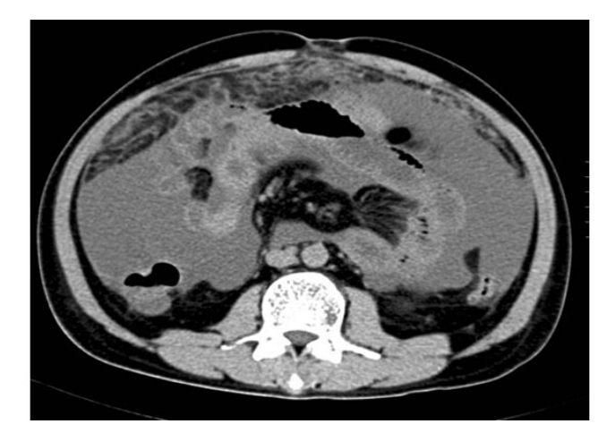
Figure 1. CT of the whole abdomen before hormone treatment: 1) diffuse changes of the omentum and thickening of the mesentery; 2) ascites

Physical examination : The patient was alert and showed no distress and was hemodynamically stable. Physical findings of skin and mucosa, the heart and lungs were normal. The abdomen was distended and tender diffusely with shifting dullness present. And rebound and guarding was observed. There was no splenomegaly, hepatomegaly and bilateral leg edema.