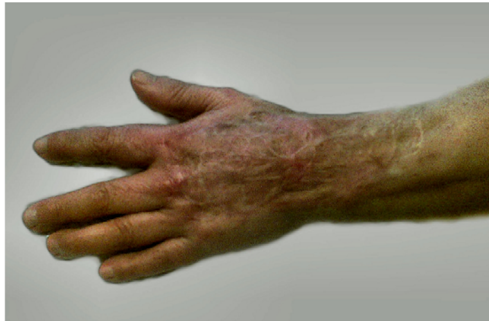
Figure 2. Condition after 2 years the cytostatic drug , anthracycline administering into the vein of the back of the hand was extravasated. Despite after repeated necrectomy, tissue transplantations, careful physiotherapy and excellent cooperation of the patient neither the esthetical nor the functional result is excellent. (swollen fingers, circle formation can be carried out with difficulties, reduced hand force compared to the other hand, and the affected hand can be used with limitations.)

nowadays this intervention is performed less often but in more departments [7, 16, 17, 35, 40, 59, 61-64]. The standard surgical intervention involves removal of the obvious necrotic tissue and plastic surgery to cover the affected area (wait and see policy) [2, 3, 7, 9, 16, 17, 34, 35, 38, 40, 42, 54] (see Figure 2). Waiting for the definitive status can cause huge discomfort for the patient, and it may require complicated and repeated plastic surgical interventions, long-term follow-up care, physiotherapy and the assistance of physiotherapist and if extravasation occurs especially next to tendons and joints, it results in loss of function. To avoid these complications it is worth to consider the possibility of early surgical intervention by early surgical consultation.