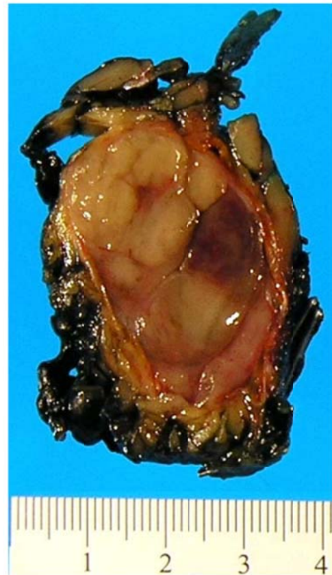
Figure 1. Gross photograph of a cut section of the adrenal gland demonstrating a large, multinodular tumor surrounded by a thin rim of uninvolved adrenal gland tissue (scale shown).

Soon after the surgery, the patient relocated out of state and was lost to follow up at our institution. Additional details regarding further therapy or prognosis is thus not available at this time.