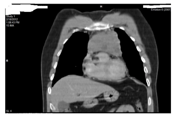
Figure 3. Axial Section-Benign thymic mass (Thymoma)

Lymphoma constituted 10% of the mediastinal masses (see Figure 4). Wychulis et al. <sup>[15]</sup> in a study of 1,064 cases in 1971 found that lymphoma constituted 10.1% of the mediastinal masses which is in concordance of present study. Published by Sciedu Press 33