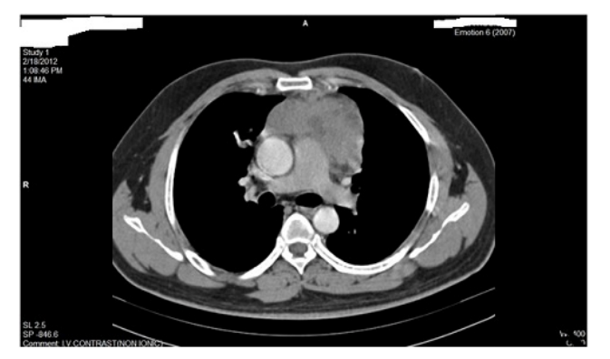
Figure 2. Coronal section-Benign thymic mass (Thymoma)