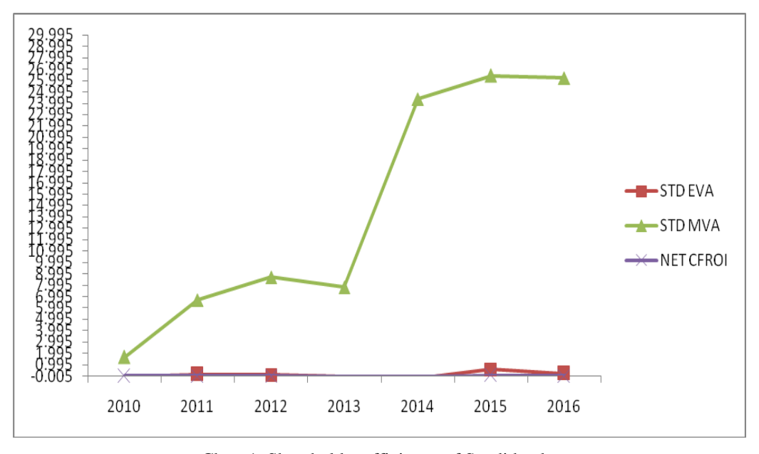
Chart 1. Shareholder efficiency of Saudi banks

It is observed from Chart 1 that Market Value Added (MVA) and Economic Value Added (EVA) by banks have increased over the years. MVA has increased rapidly while EVA definitely signals a positive outlook. Stewart (1990) state that Market Value Added = Present value of all future EVA. Accordingly increase in EVA also increases its MVA and this relationship +/- would have its implications on the banks' valuation. The MVA value on the other hand represents a highly positive outlook of the investors on the Saudi banks' performance.