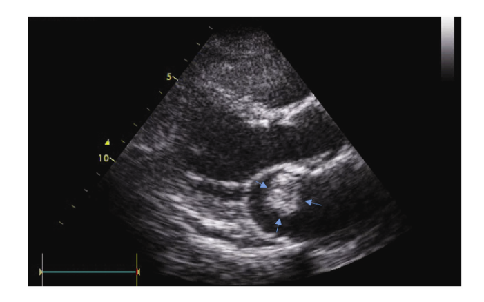
Figure 1. Parasternal long axis view is showing mass in left atrium.