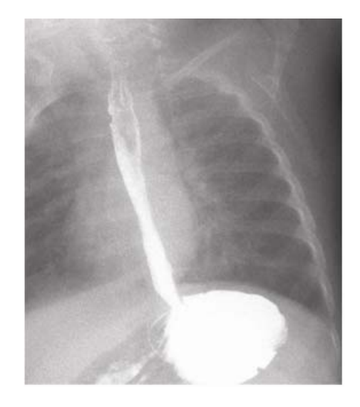
Figure 3. Normal upper gastrointestinal study of the second patient in the actuality.

Both patients are currently asymptomatic whit a complete diet (see Figure 3).